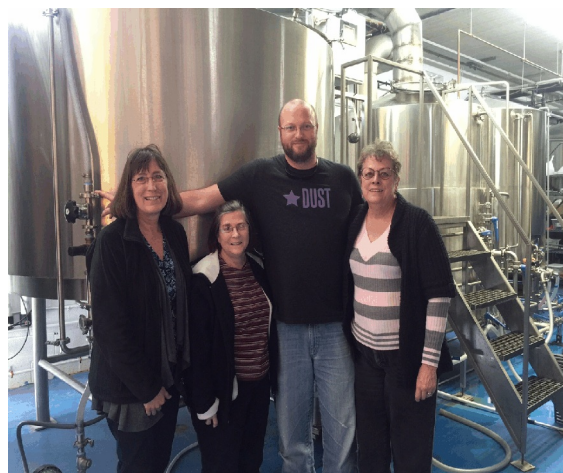
Impromptu Field Trip to Yellow Springs Brewery.