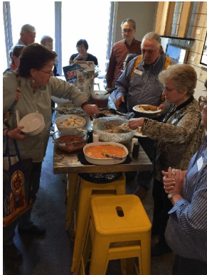
Time to chow down! No one went home hungry!

Finally, summer is here. (Well, almost.) We had our picnic early this year so I am counting that as the beginning of my summer. I think everyone who came that evening had a good time and as usual the food was marvelous. We are such good cooks!