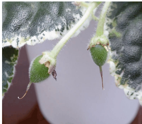
Seed pods ripening on bloomstalks

Not all plantlets turn out to be winning plants. One seed pod can contain more than 100 seeds! But that's part of the fun of hybridizing: You never know when the next gorgeous Best in Show violet will appear!